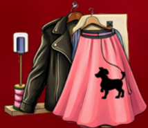
COSTUME & WARDROBE