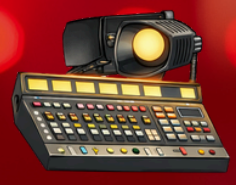
LIGHTING & PYROTECHNICS

Our Lady's is really excited to be working on this year's school production of Grease, and we would love to invite members of our school community to be part of the journey.