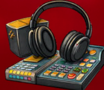
SOUND & MICROPHONES