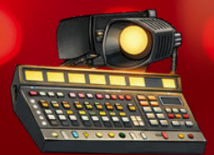
LIGHTING & PYROTECHNICS

Our Lady's is really excited to be working on this year's school production of Grease, and we would love to invite members of our school community to be part of the journey.