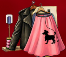
COSTUME & WARDROBE