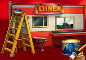
SET DESIGN & PROPS