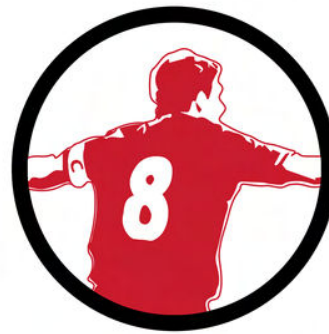
STEVEN GERRARD Academy

The Steven Gerrard Academy (SGA) is a football and education program for 16–19-year olds, blending elite player development with career-focused academics, offering UEFA coaching, sports science, and pathways to university, scholarships (including in the USA), or careers in the football industry, with locations across the UK. They provide qualifications (like Level 2/3 Diplomas), real-world work experience, and opportunities to play competitively, helping young athletes develop both on and off the pitch.