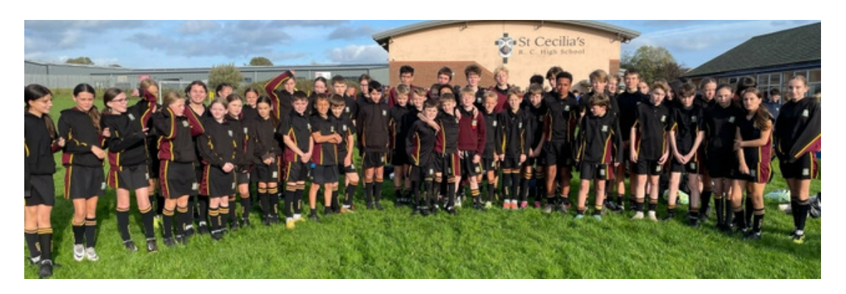
Those top 10 finishes included:

Fifty-six Our Lady's pupils from across all year groups represented the school in the annual district cross country event held at St Cecilia's and Longridge High Schools on Friday 13th October. The course had taken on quite a bit of rain over the previous two weeks which made it particularly heavy underfoot and those running in the later races felt the most impact of this. The conditions did not deter the team and all of those who took part represented the school with fantastic dedication and commitment. There were also some tremendous top 10 finishes by many Our Lady's pupils with some of those destined to represent the Preston district schools' team in the county competition in January 2024.