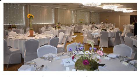
Year 11 Prefect Ball