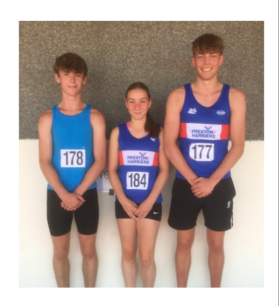
A tremendous achievement by those involved.

Both boys ran an extremely strong race with Will knocking 6 seconds off his previous personal best to achieve 4 minutes 48 seconds, while George ran a very impressive 4 minutes 15 seconds to secure a 3rd place finish and also a new personal best.